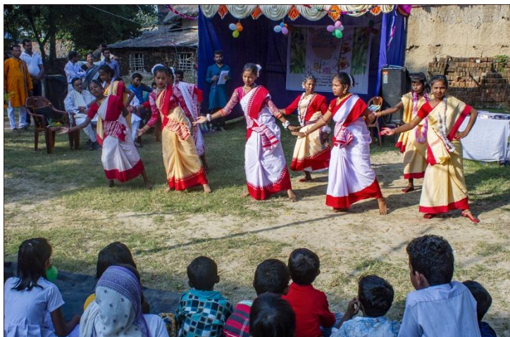
Children's day celebrations