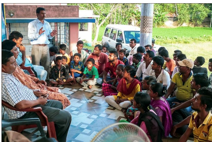
Sandipur Village development committee