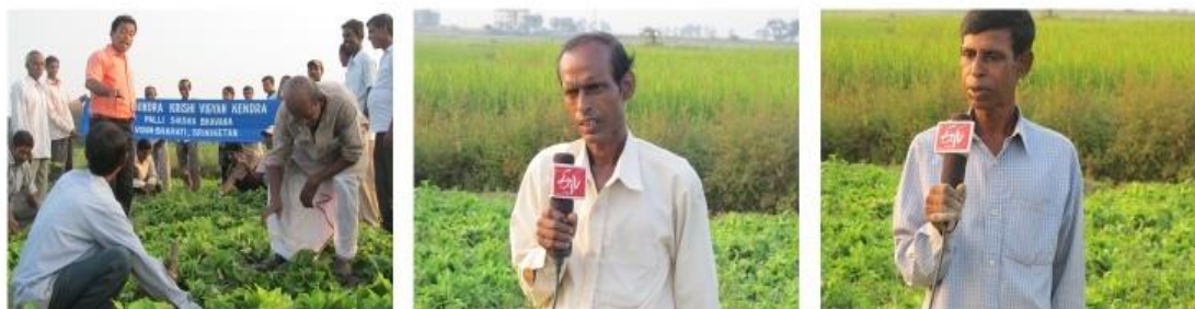
Ekangi ( Kaempferia galanga ) Cultivation as crop diversification for doubling farmers income- an initiative taken by RKVK, Birbhum, W.B- a Success story

It is also known as aromatic ginger, kencur etc. cultivation of Ekangi ( Kaempferia galanga L.), a medicinal plant was initiated by the Rathindra KVK (RKVK) in the Kartikdanga village in kharif season, in mono cropped paddy area as crop diversification programme. Ekangi has several medicinal properties. Its rhizome powder is used as appetite enhancer, stomach-ache. The rhizome extract is largely used as liminant for rheumatism, repellent of mosquito and nematode against Melidogyne in wheat. Before cultivation of Ekangi they cultural paddy variety MTU-7029 and earned net return of Rs. 22,500.00 per ha in their rainfed mono cropped area with B:C ratio of 1.82 . After crop diversification with Ekangi cultivation initiated by RKVK the net return was Rs. 7,47,500.00 to 8,75,000.00 per ha B:C ratio of 6.03 to 6.3 . Vertically yield has been increased to 16 % for 2016-17 to 2017-18. The practice is now spread to 7 villages in another 30 farmers of surrounding 3 other blocks of the district.