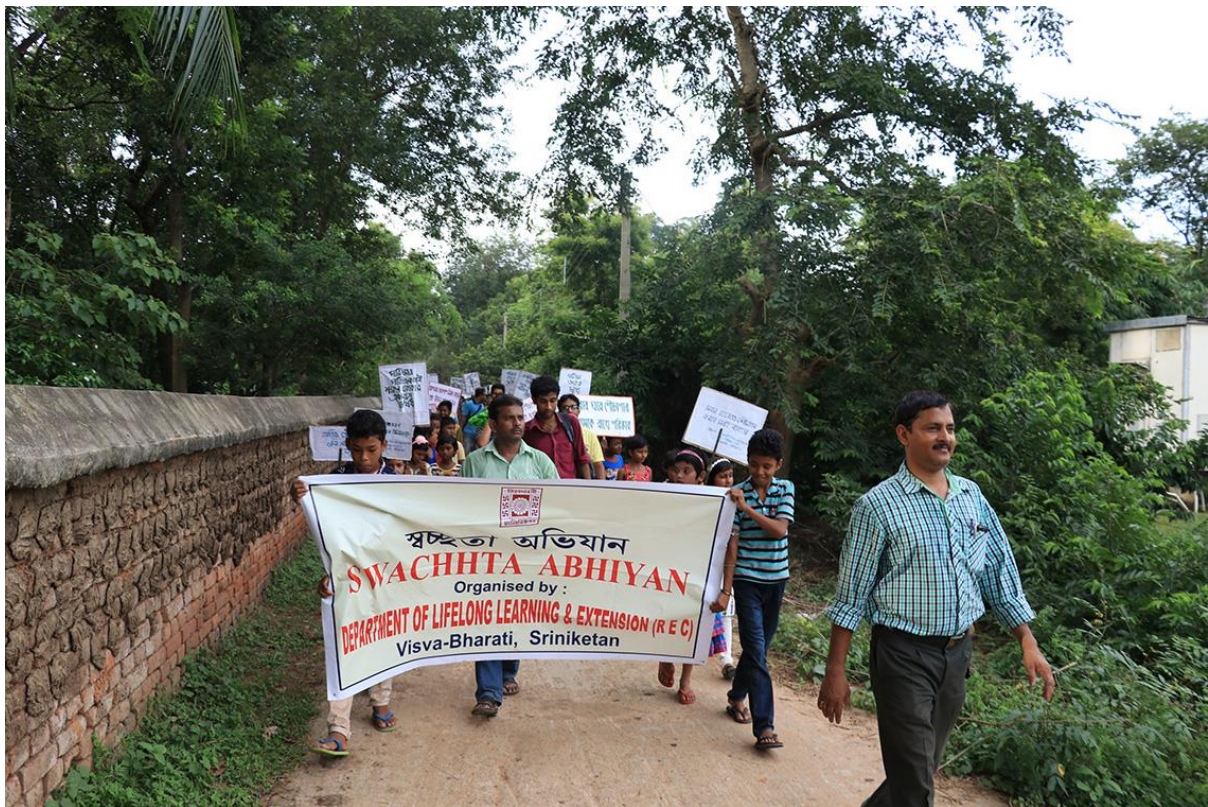
Swachhta Abhiyan Awareness at nearby villages