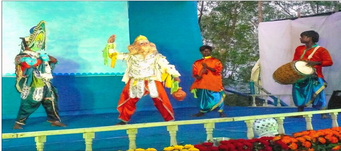
Promoting and creating awareness of the traditional art forms