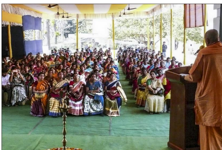
Women's Self Help Group convention