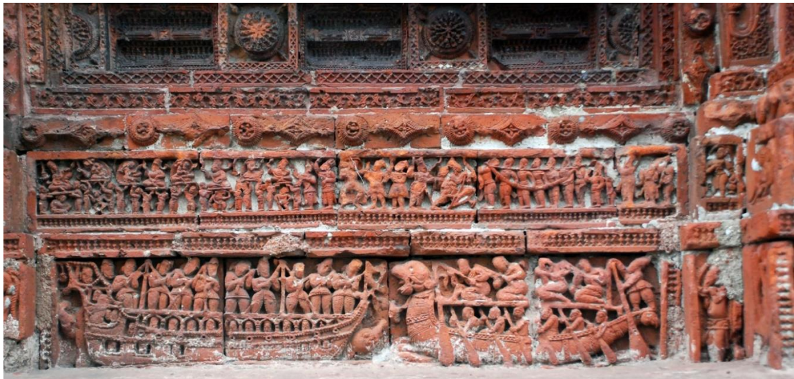
DETAILS OF HANSESWARI TEMPLE