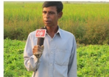
Ekangi ( Kaempferia galanga ) Cultivation as crop diversification for doubling farmers income- an initiative taken by RKVK, Birbhum, W.B- a Success story