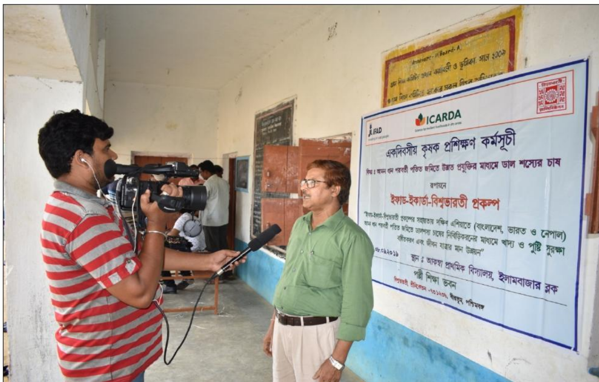
Interaction with Doordarshan, Santiniketan, West Bengal