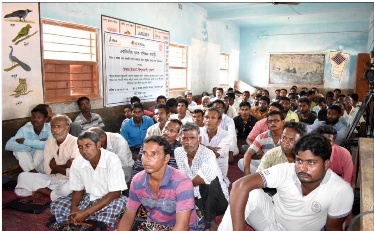
Farmers participated in training programme at Akamba primary school, Illambazar Block on 08.09.2019