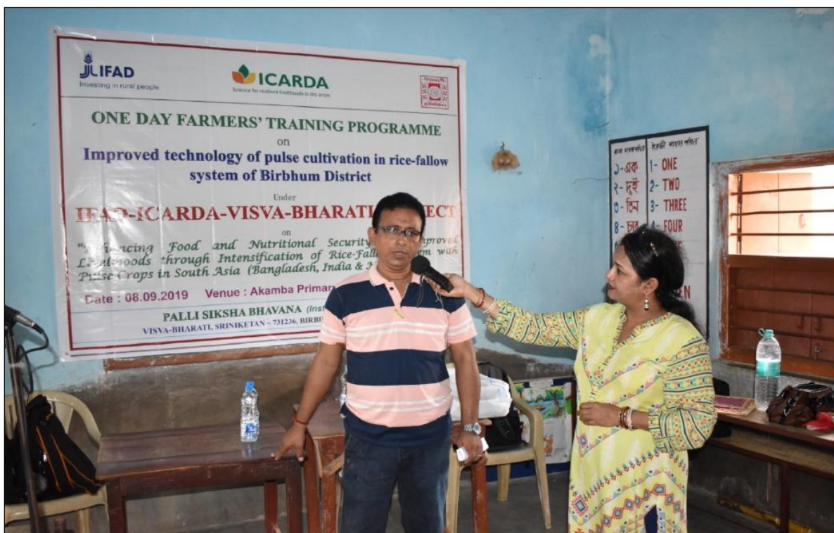
Interaction with All India Radio, Santiniketan, West Bengal