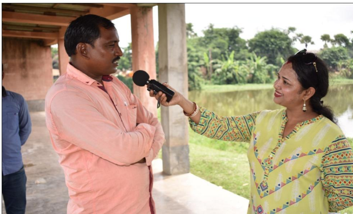
Interaction with the farmer by All India Radio, Santiniketan, West Bengal